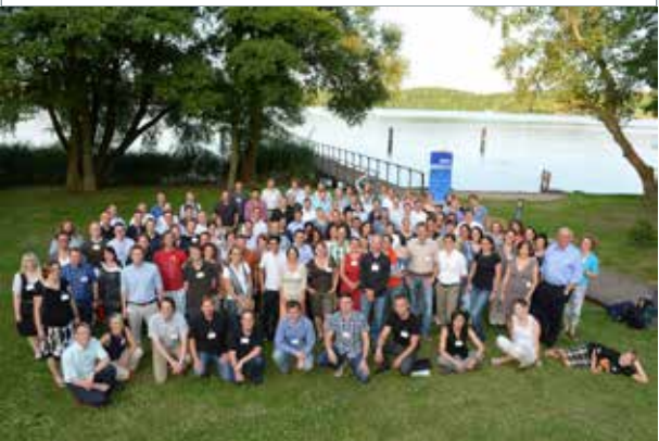
Participants of the Emmy Noether Annual Meeting in Potsdam, Germany